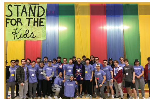
Undergraduates raised more than $1,200 at Soonerthon.