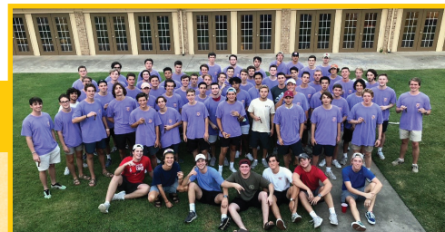
The Delta Alpha recruitment team with the fall 2018 pledge class.