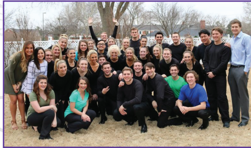
Delta Tau Delta and Alpha Phi perform at Sooner Scandals on Mom's Weekend.

Another area we experienced great success