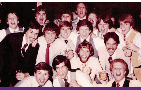
Spring 1975 Formal Party: Taken shortly after we were initiated - obviously in a celebratory mood!

Obviously, another love we all share is Sooner football; therefore, we choose an away game weekend in the fall so Norman is not as crowded. We book a block of rooms for those out-of-town and