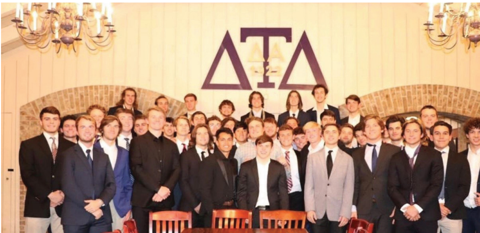
Some of the members of PC '19 after their initiation.