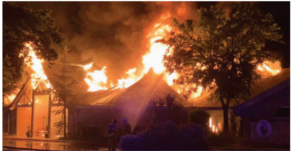
Lightning struck our historic shelter resulting in a fire.

As many of you may know, our legendary shelter of 51 years was struck by lightning in the middle of the night on May 7, 2020, resulting in a fire. Thankfully, no one was inside at the time of the fire. As we examine the structure left behind in the rubble, we are determining our path forward. We will never forget all the great memories that have been made in this shelter since 1969, but we will be planning a strong, new building in which our brotherhood can continue. We are very optimistic for what the future holds. You will find pictures on pages three and four, along with sentiments from fellow brothers.