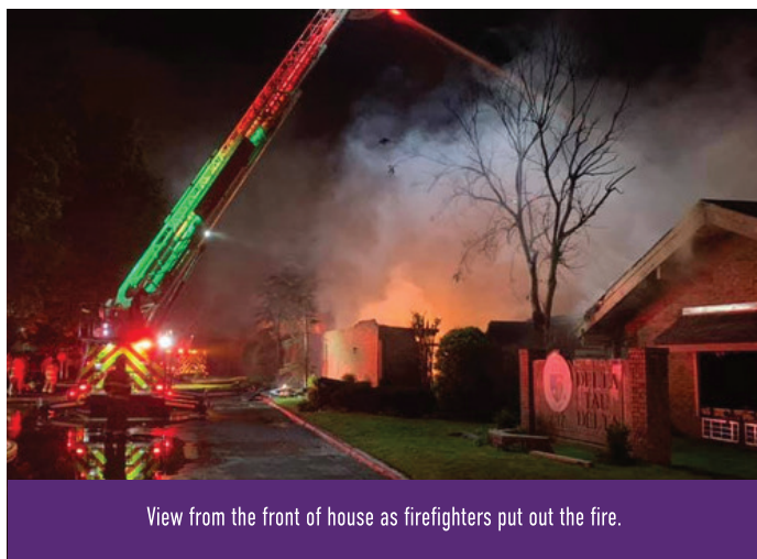
View from the front of house as firefighters put out the fire.