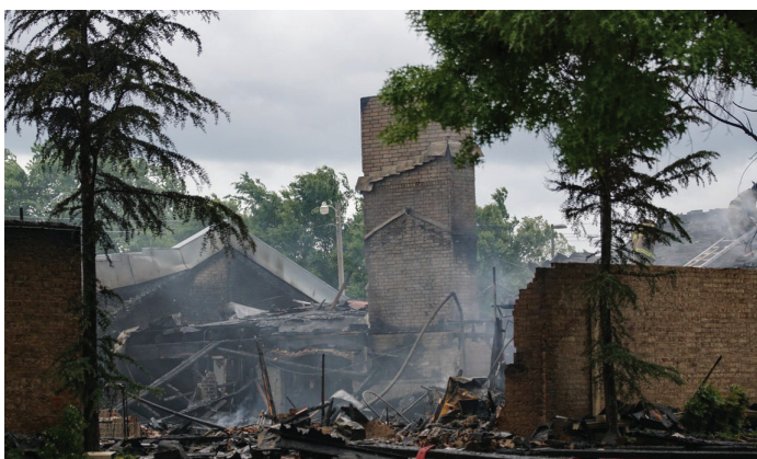
East part of the shelter has been destroyed by the fire.

On a more personal note, the shelter was home to so many great memories. I encourage you to reminisce on the great times and friends that were made in the shelter. It will truly be missed. Thank you to everyone that has reached out! We will inform you when we have an updated plan. Stay safe and healthy.