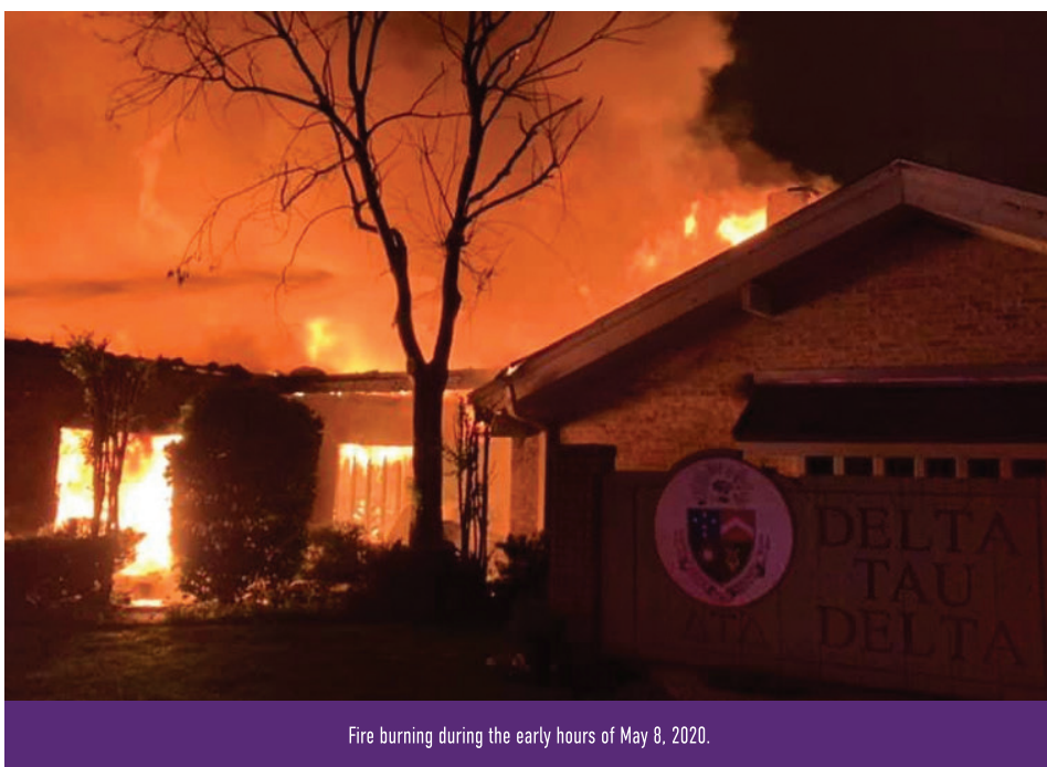
Fire burning during the early hours of May 8, 2020.