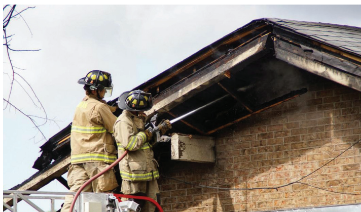
Firefighters work to put out the fire.