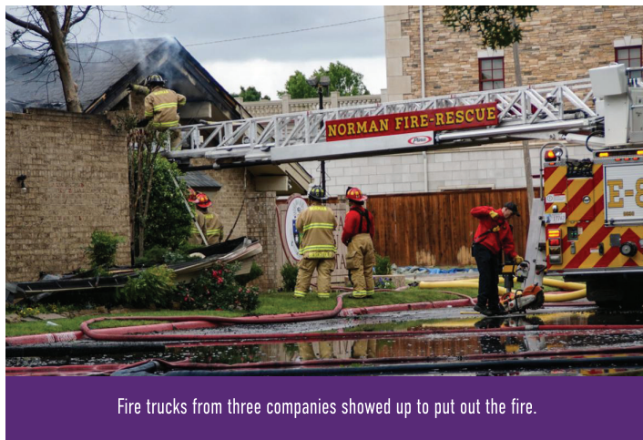
Fire trucks from three companies showed up to put out the fire.